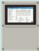
PAW-A2W-CMH Cascade Controller. Modbus IP for BMS communication.